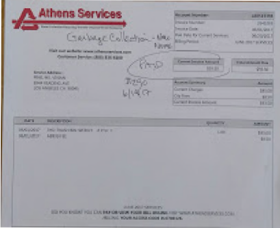
Athen bill June 2017.jpg 394K