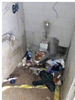
Boardwalk Public Restrooms 2020-03-12 at 6.04.02 PM.png 502K