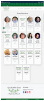
GHSNC Screenshot_16-9-2025_94921_ghsnc.org.jpeg 903K