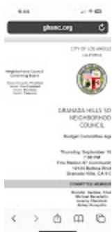
GHSNC BUDGE NOTICE VACANCIES Screenshot 2025-09-16 at 9.44.50 AM.jpeg 220K