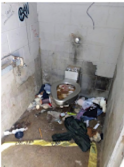
Boardwalk Public Restrooms 2020-03-12 at 6.04.02 PM.png 502K