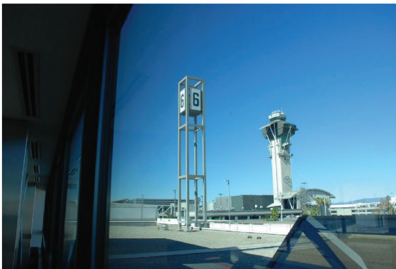
Figure 1 – Historic Sign