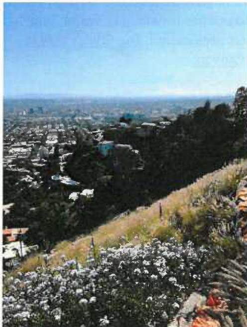
The hillside at Crisler Way has a 70% slope

Laurel Canyon has many paper streets and the neighborhood deserves to be informed of such impacts that will affect their access for long periods of time. The motion was initialed from the Crisler Way road improvement (B permit - BD-401611), which has expired. The 2004 approval for this B permit needs to be redesigned to include codes changes since 2004 and all related infrastructure. Below is a photo of the location of Crisler Way proposed road improvement, photo taken from Grand View at start of Crisler Way.