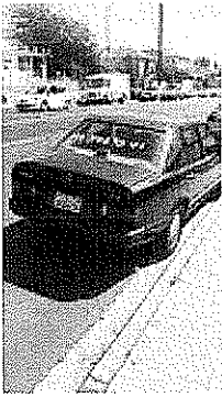
virgil Cars 4.jpg 2314K