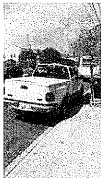
Virgil Card for Sale 2.jpg 1807K