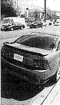
virgil cars 5.jpg 1941K