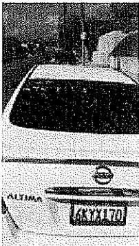
virgil cars 6.jpg 1300K