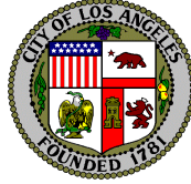
ERIC GARCETTI MAYOR

Council and Public Services Division 200 N. SPRING STREET, ROOM 395 LOS ANGELES, CA 90012 GENERAL INFORMATION - (213) 978-1133 FAX: (213) 978-1040