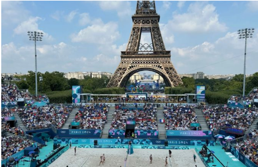
Eiffel Tower/Champ de Mars - Temporary outdoor arena and spectator seating.