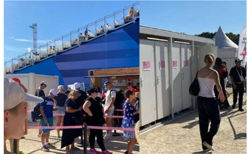
Esplanade des Invalides - Temporary spectator seating, food concession, public restrooms.