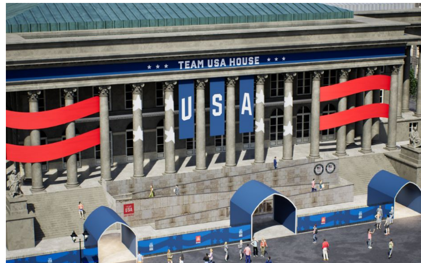
Non Competition Venue: Team USA International House Conversion of Palais Brongniart, with temporary banners and secured perimeter.