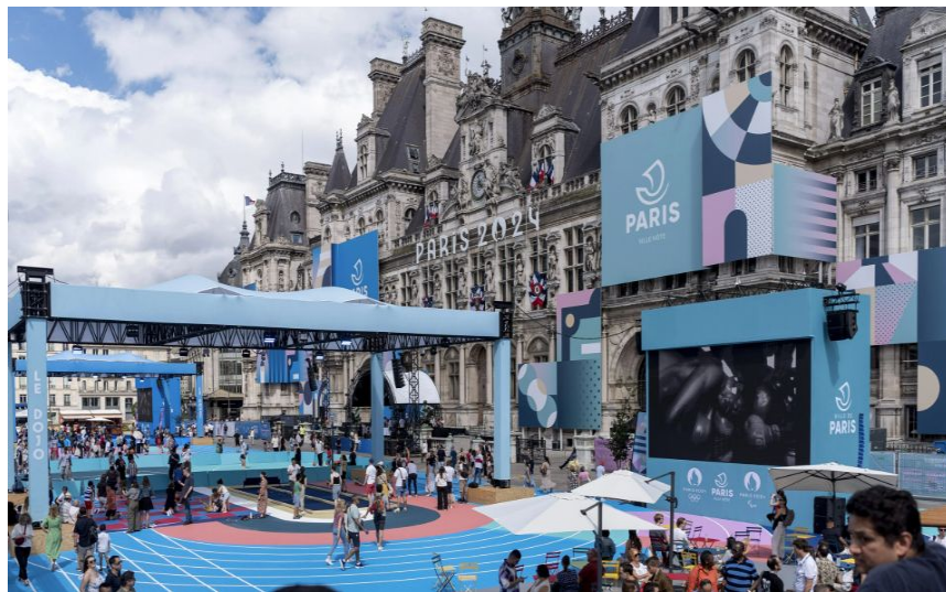
Non-Competition Venue: Temporary installations at Fan Zones, Hotel de Ville (Paris City Hall).