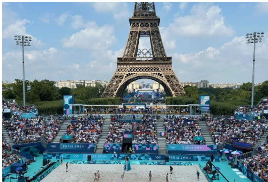
Competition Venue: Eiffel Tower/Champ de Mars - Temporary outdoor arena and spectator seating.