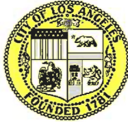
ERIC GARCETTI MAYOR