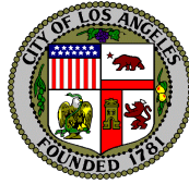
ERIC GARCETTI MAYOR

Council and Public Services Division 200 N. SPRING STREET, ROOM 395 LOS ANGELES, CA 90012 GENERAL INFORMATION - (213) 978-1133 FAX: (213) 978-1040