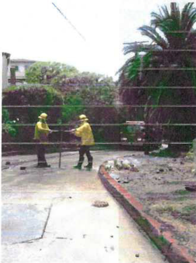
Fire hydrant sheared off by a hit and run vehicle