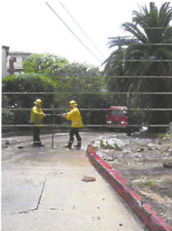
Fire hydrant sheared off by a hit and run vehicle