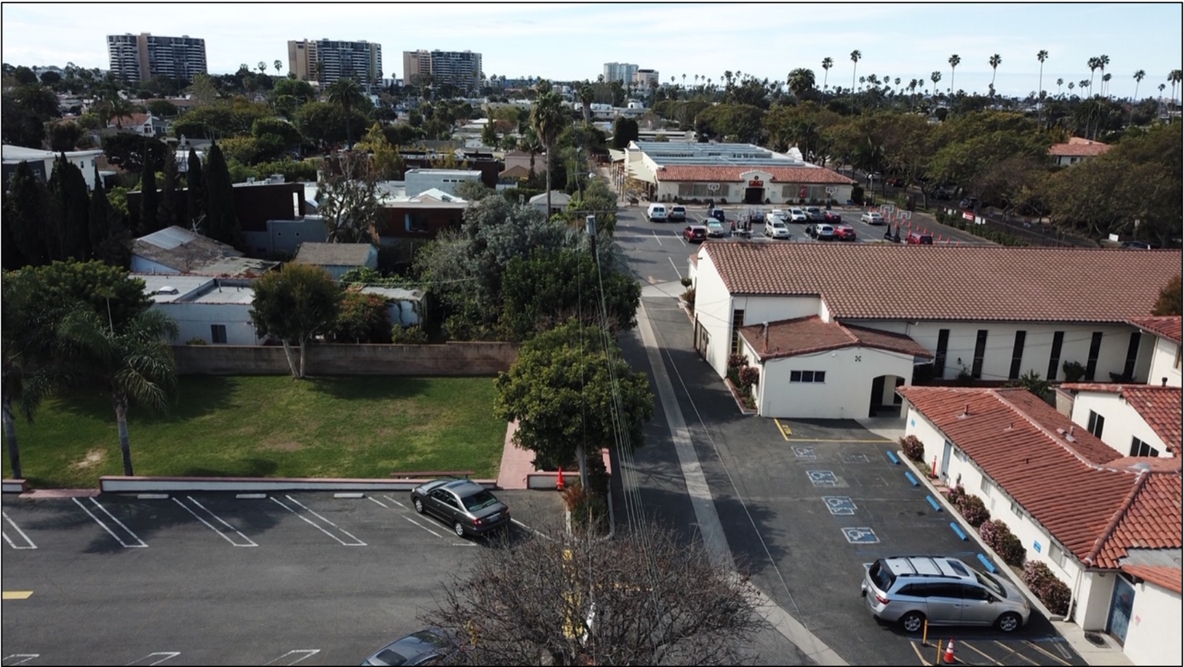
View from apartments and rooftop deck of Lincoln Apartments, overlooking St. Mark playground and outdoor classroom.