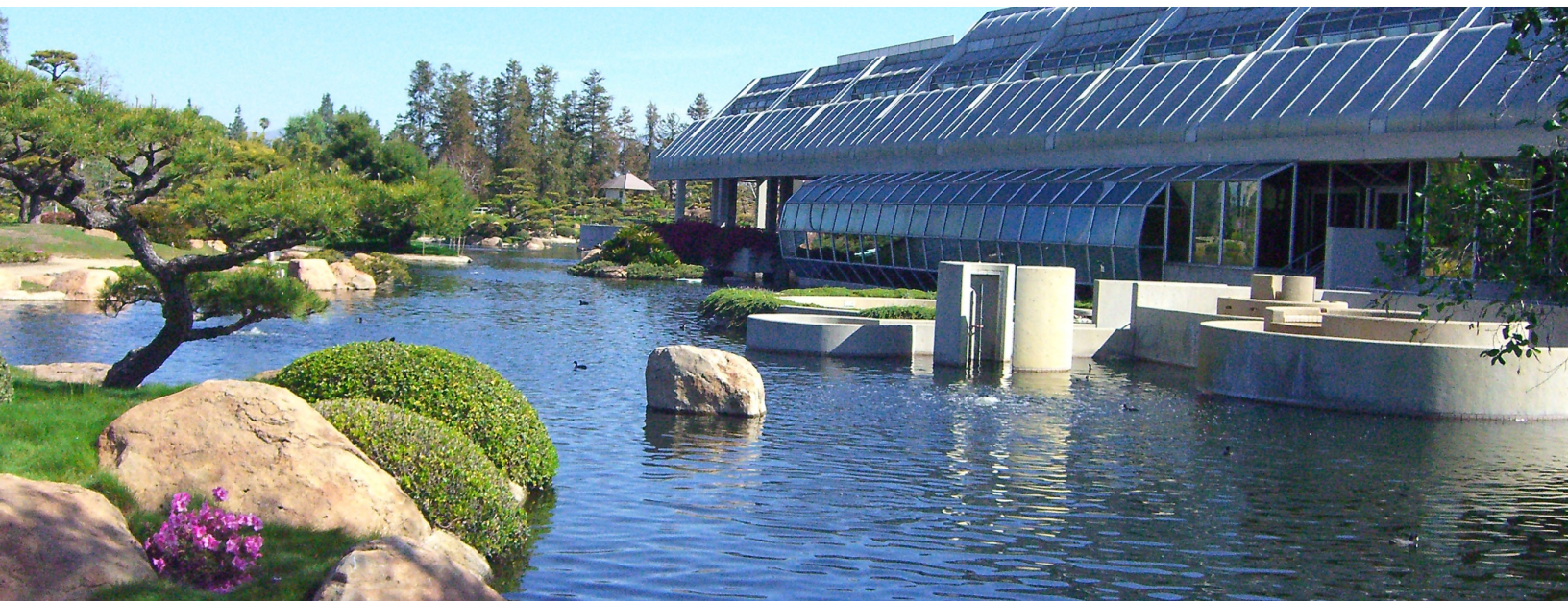
Donald C. Tillman Water Reclamation Plant and Japanese Gardens

Ecological systems. Environmental considerations are an important part of flood control systems. As the Los Angeles flood control system neared completion and public demand for water supplies, recreation and beautification increased, Congress provided for multiple use of facilities. By the 1960s watershed protection, electrical power, recreation, agriculture and water storage were integral secondary uses of flood control systems and considerations in flood control systems planning. Paving of the Los Angeles River bottom, and City in general, reduced groundwater recharge. To compensate for the loss, water spreading grounds were established to replenish underground aquifers. Three sections of the Los Angeles River have unpaved bottoms partially due to the existence of natural springs. These sections and dam basins provide natural habitats for wild animals and birds. The dam basins also provide land for recreation and agricultural uses. Sand bars, trees and heavy marsh growth provide protected habitats for water birds. Fish live in the river channel. Until 1984, the Los Angeles River channel, except for the unpaved sections, virtually was dry except during the rainy season. Upon completion of the San Fernando Valley Donald C. Tillman Wastewater Reclamation Plant (1984) a continuous flow of reclaimed water was sent down the channel creating a year round stream which has regenerated plant and animal