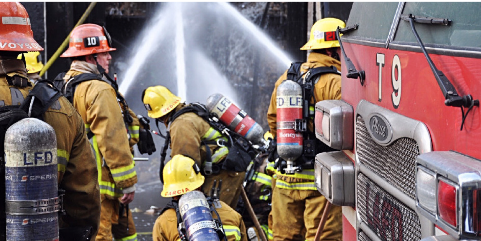
Los Angeles Fire Department responding to a structure fire.

The Los Angeles City Fire Department was established on February 1, 1886. Thirty firefighters, most of them former volunteers, were hired to man four leased firehouses. In addition, volunteer units were retained in the less populated areas outside the central city, including the San Fernando Valley. From the beginning the Department was an innovative, progressive agency which sought to secure the latest equipment, utilize the latest techniques and to develop better methods for fire fighting and prevention.