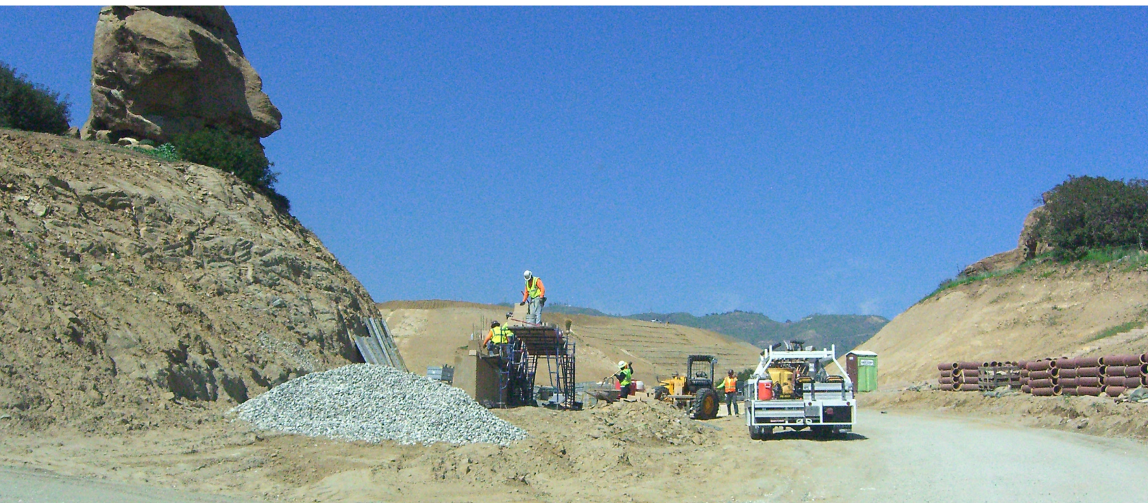
Hillside grading in the western San Fernando Valley .

The principal tools for mitigation of geologic hazards is the City's Municipal Code, including the Building and Zoning Codes. In 1929 the Building and Safety Department began to compile and correlate data on soil conditions for distribution to realtors,