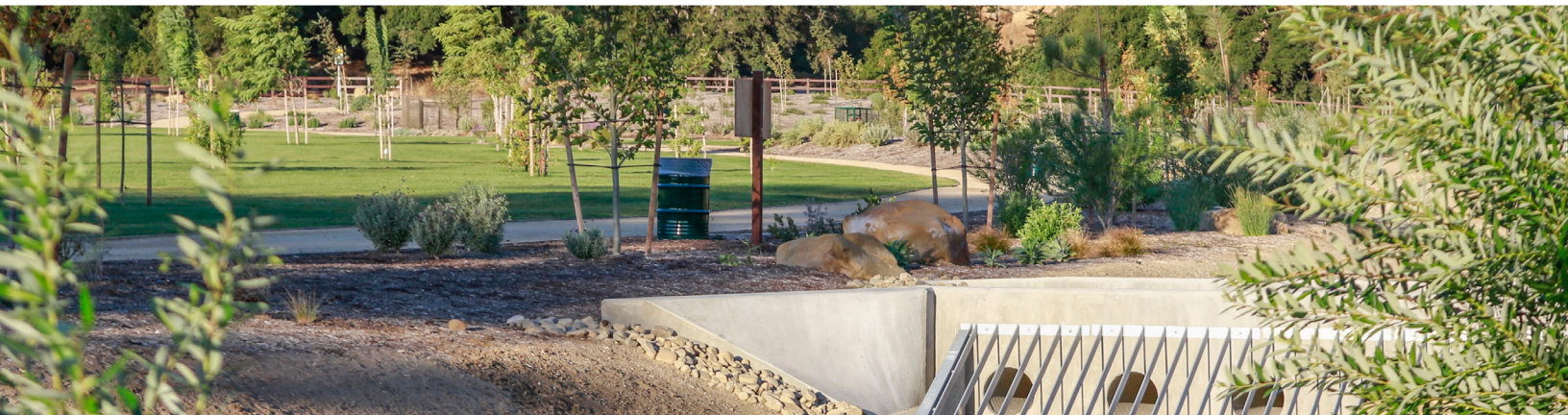
Stormwater infrastructure in Chatsworth Park South.

Generally short term goals are targeted for 0-5 years, medium term goals are 5-10 years, and long term goals are expected to take 15+ years to implement. A listing of department abbreviations is available in Appendix A.