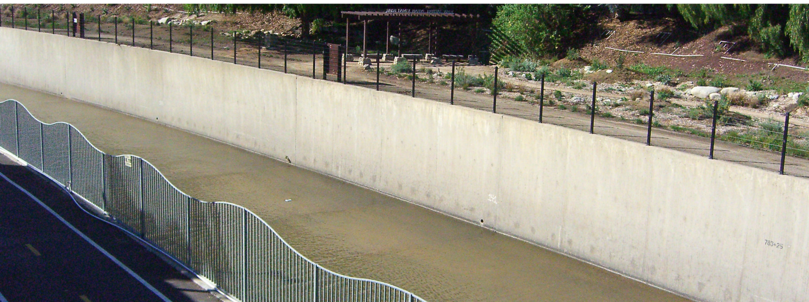
The Los Angeles River in Studio City, once a source of frequent flooding, now serves as a transportation and open space resource.

Capital floods. Major storms which cause a high magnitude of water flow can be devastating to a wide geographic area. They are the most dramatic and potentially the most hazardous water activity confronting the City. The Los Angeles region is a semi-arid region with rainfall that can have dramatic variation from year to year. Rains tend to occur in heavy, short duration storms between November and April. Severe storms are periodic and may not occur for several years. Paving of the City with structures and impermeable surfaces has reduced natural ponding areas which allowed water to