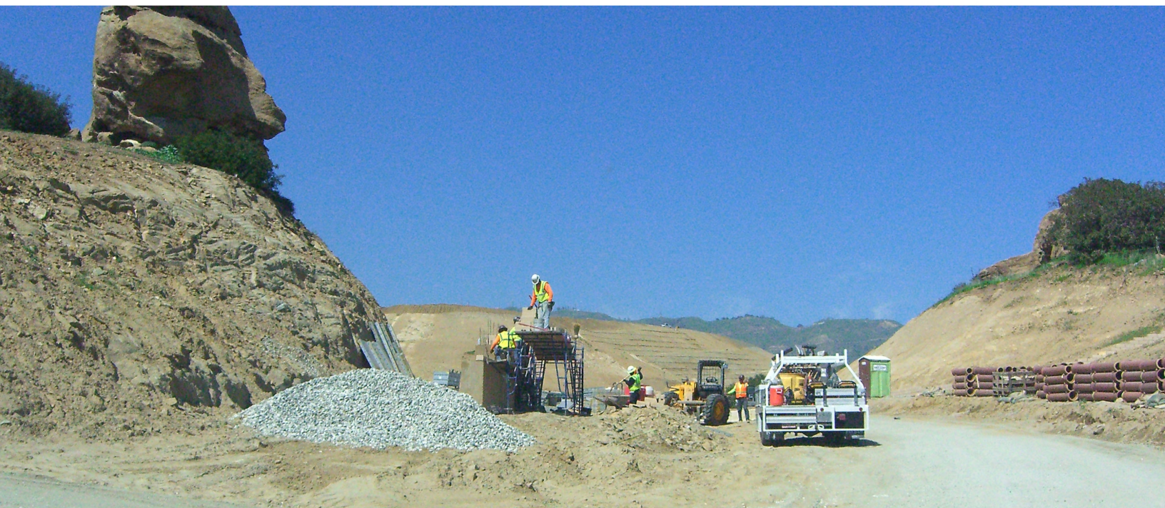
Hillside grading in the western San Fernando Valley .

The principal tools for mitigation of geologic hazards is the City's Municipal Code, including the Building and Zoning Codes. In 1929 the Building and Safety Department began to compile and correlate data on soil conditions for distribution to realtors,