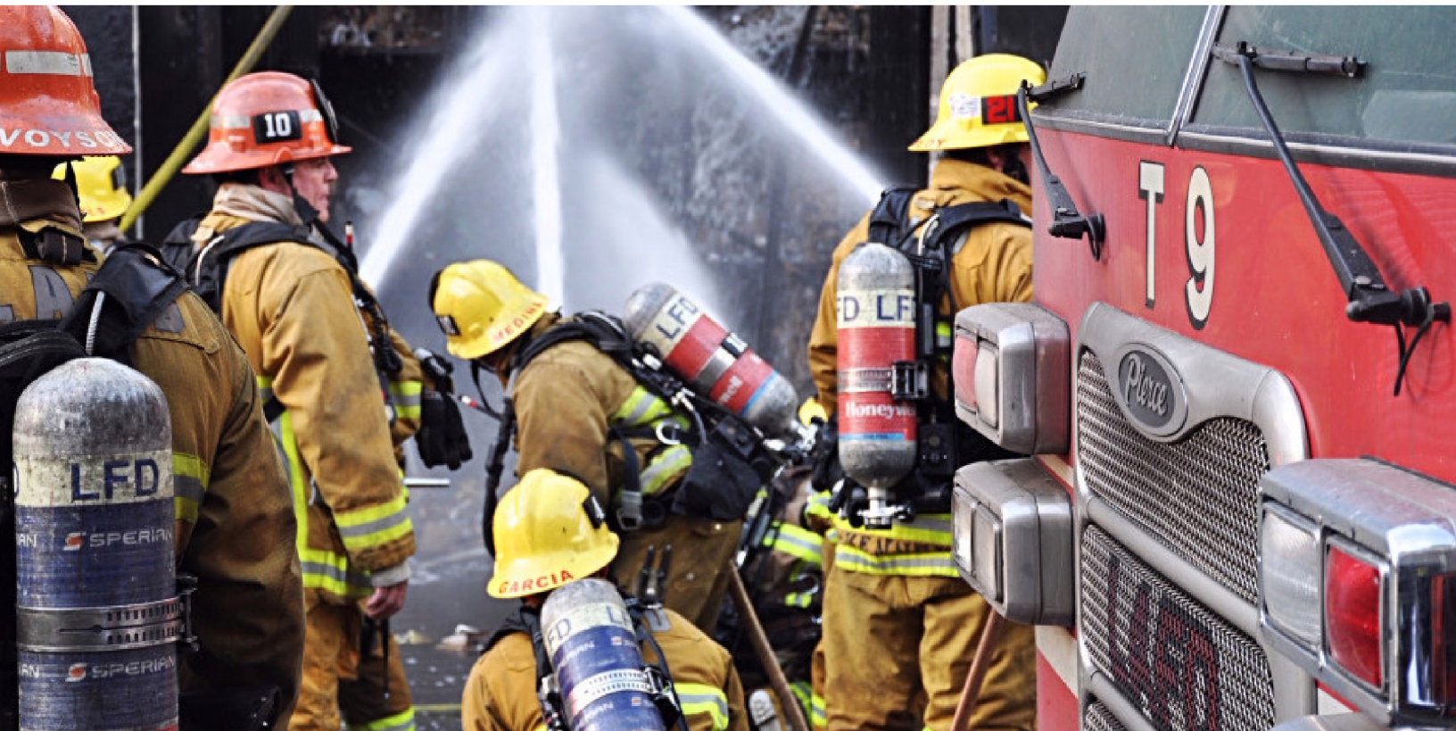
Los Angeles Fire Department responding to a structure fire.

The Los Angeles City Fire Department was established on February 1, 1886. Thirty firefighters, most of them former volunteers, were hired to man four leased firehouses. In addition, volunteer units were retained in the less populated areas outside the central city, including the San Fernando Valley. From the beginning the Department was an innovative, progressive agency which sought to secure the latest equipment, utilize the latest techniques and to develop better methods for fire fighting and prevention.