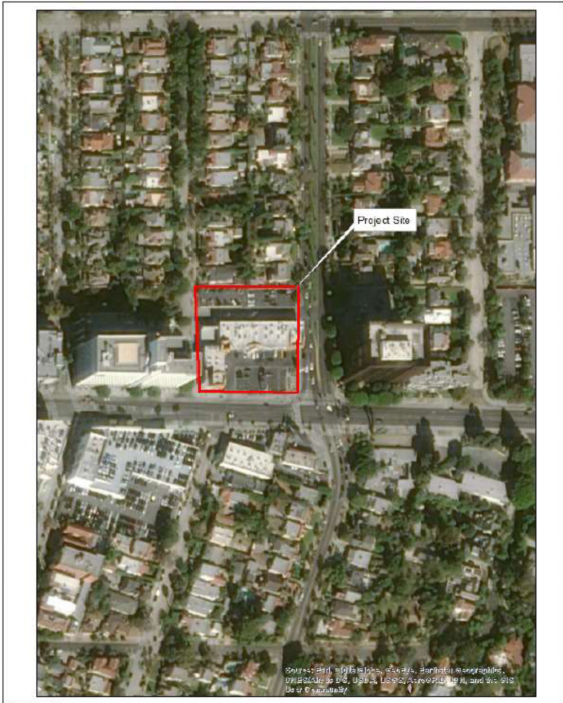
Figure 1 – Proposed Project Site