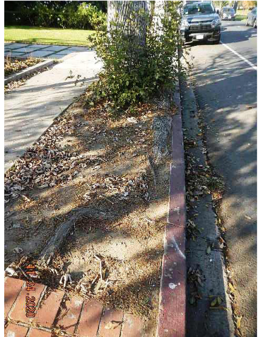
#1 Ash – note surface roots on the north side and damaged sidewalk. #1 Ash – note surface roots on south side