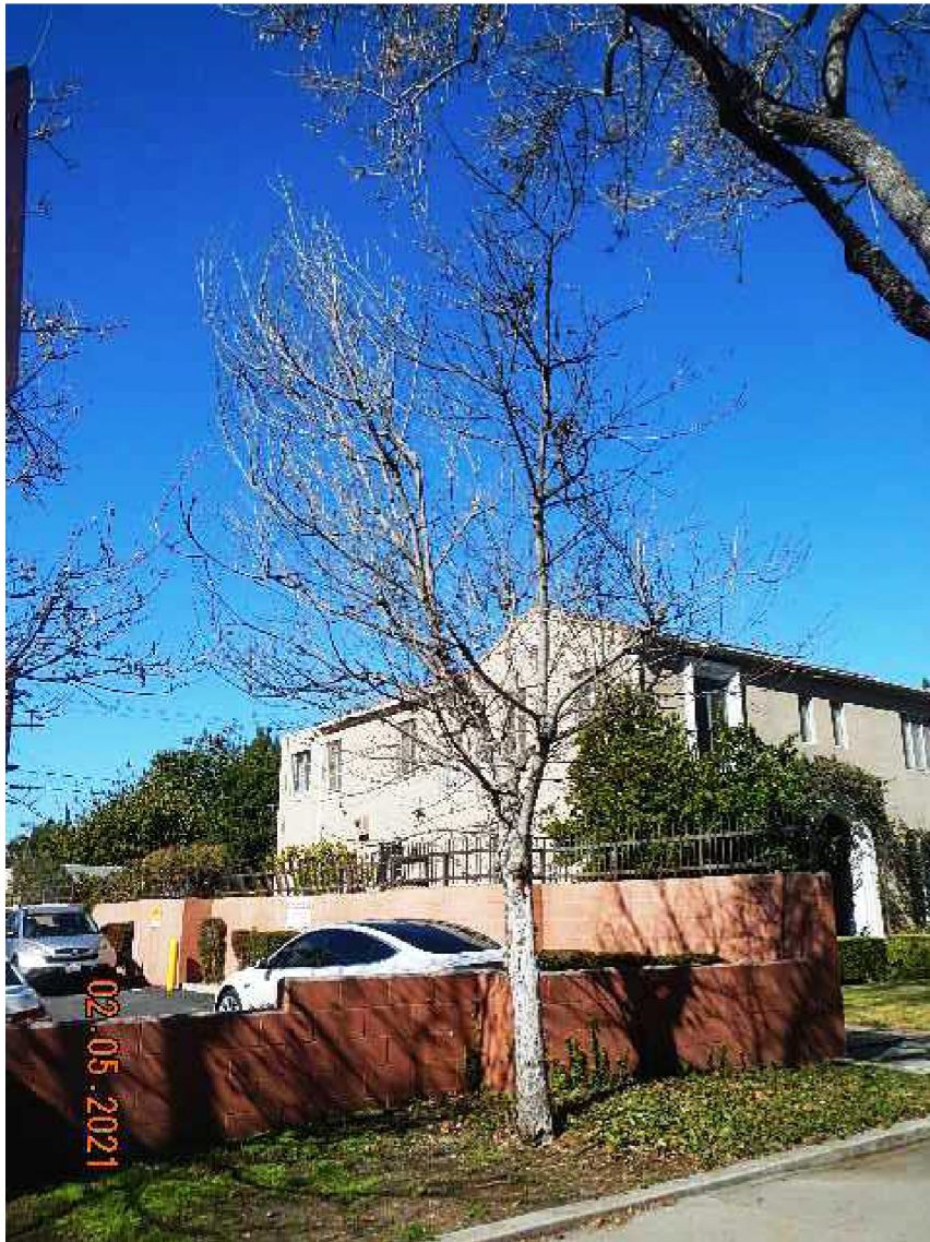
#2 Silver maple – note codominant leaders and overhead ash