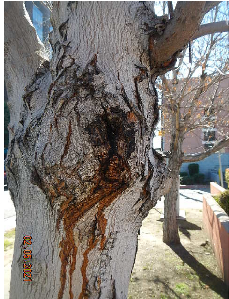
#2 Maple, note bleeding old flush cuts.