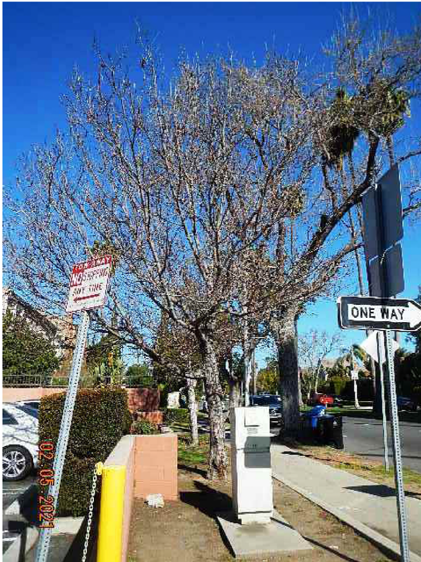
#3 Silver maple – note narrow planter and crowded limbs.