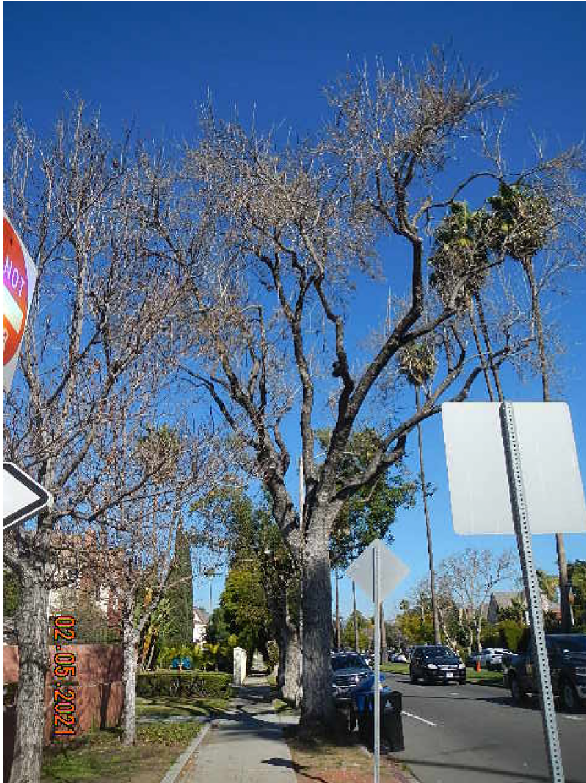
#1 Arizona ash on Highland has been lion-tailed and headed.