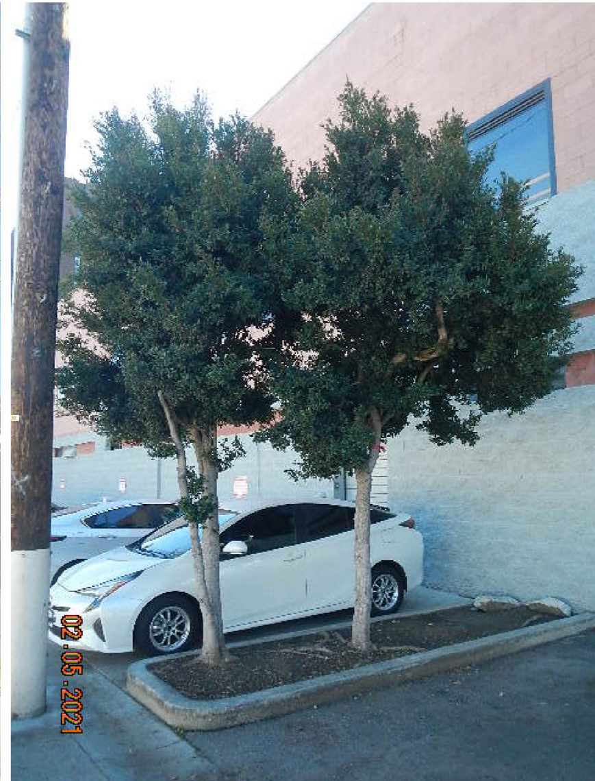
#4 & 5 Compact brush cherries and shallow crowded roots.