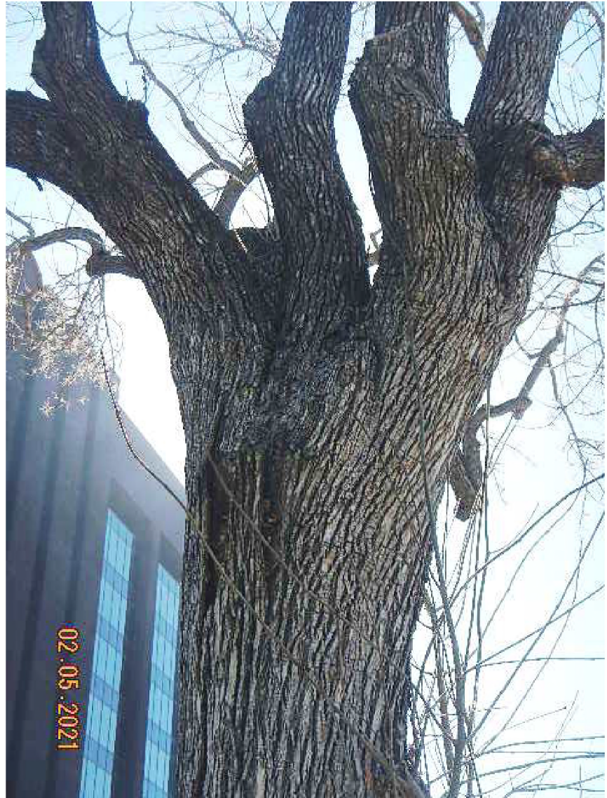
#1 Ash, note included bark and loose bark below – a warning sign