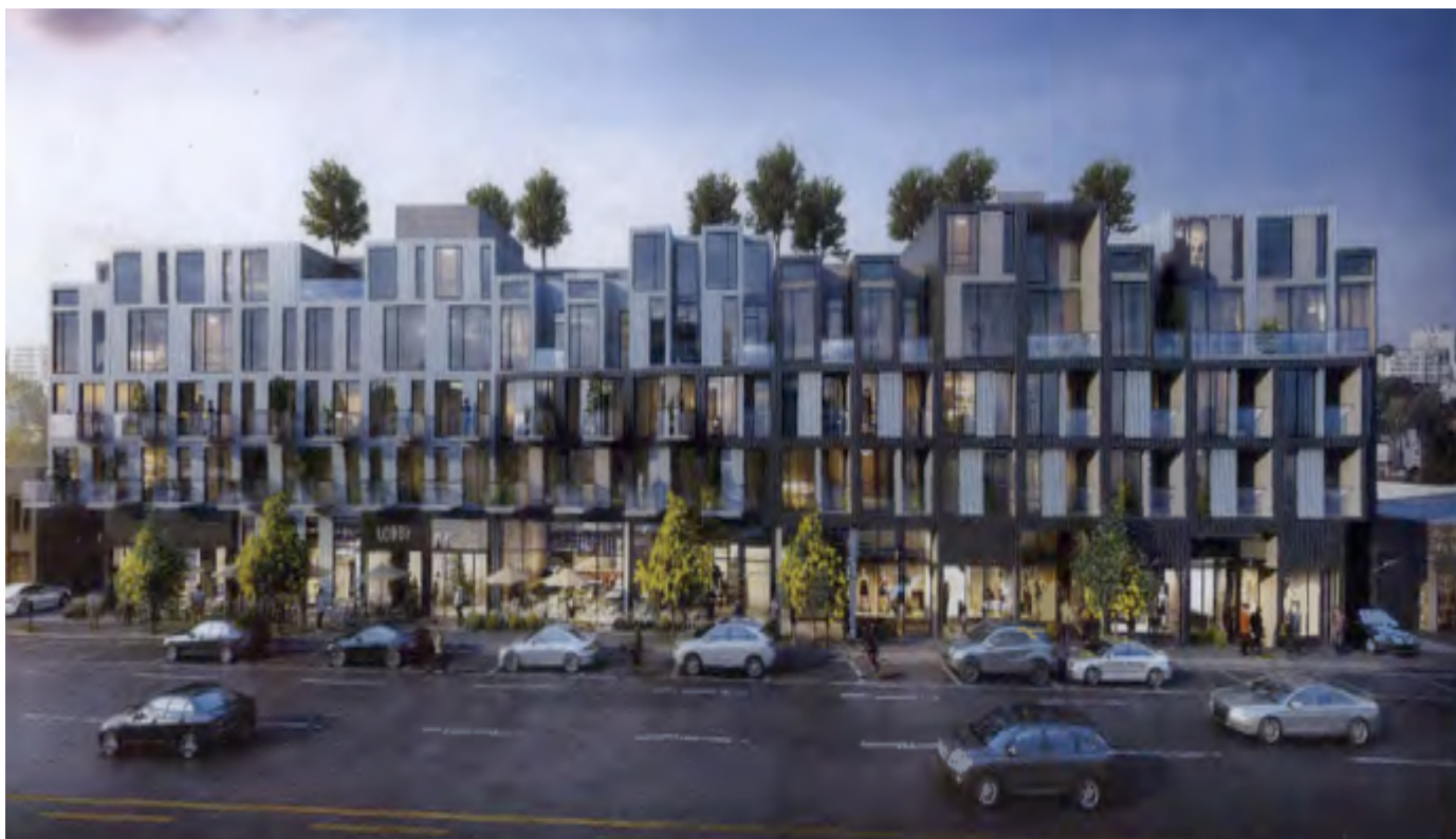
Rendering of RYDA’s approved 104-unit project at 3301-3327 Sunset Blvd.