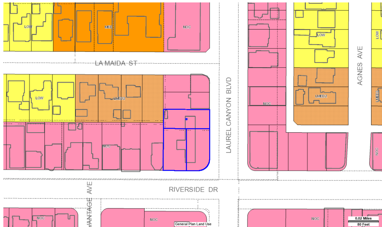
Figure 2. General Plan Land Use map

The subject site is bounded in all four cardinal directions by commercial properties similarly designated for Neighborhood Office Commercial land uses. Surrounding properties are similarly zoned [Q]C2-1VL and developed with one and two story commercial buildings. The west adjoining property is developed with a drive-thru dry cleaners; north adjoining property is developed with a one-story bank and related surface parking lot; south abutting property is developed with a gas station, convenience store and drive-thru car wash; east abutting property is developed with a multi-tenant commercial center which include sit down eateries and a coffee shop; and the southeast abutting corner is developed with a grocery store and large parking lot.