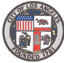
ERIC GARCETTI MAYOR