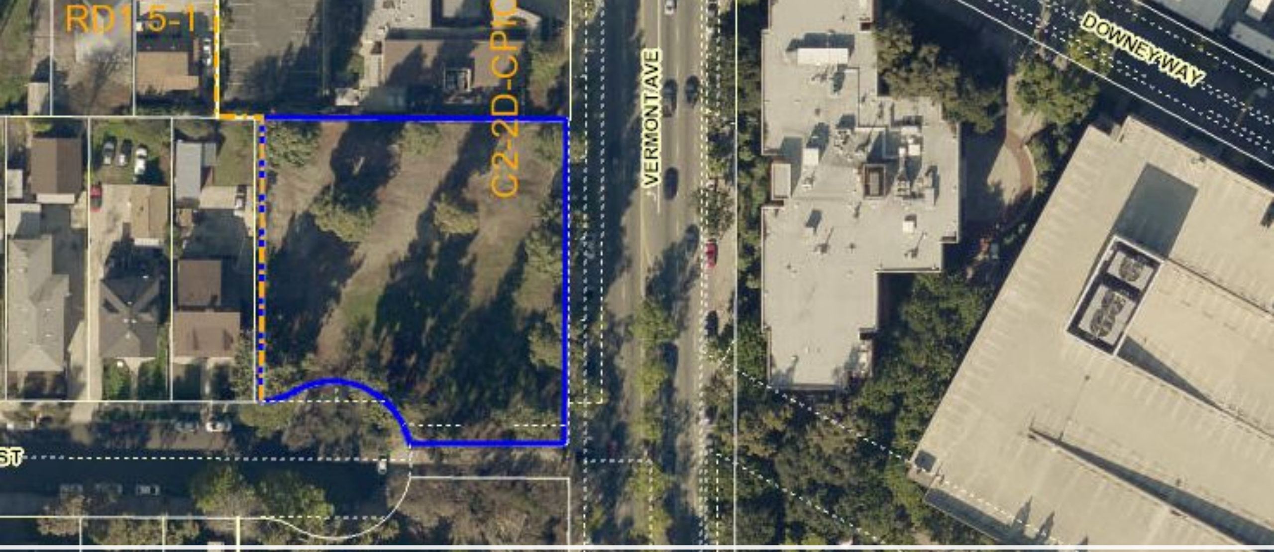
3685 S. Vermont Avenue Former Bethune Library