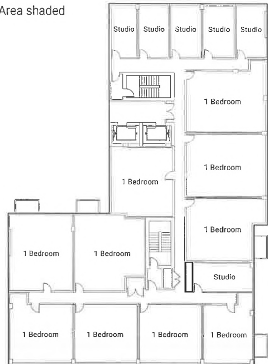
Levels 2-5 Building Area 7,676 sf (per level)