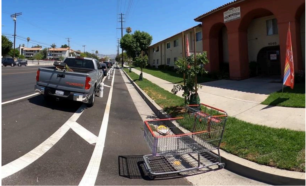
Shopping cart and trash obstructing bike lanes.