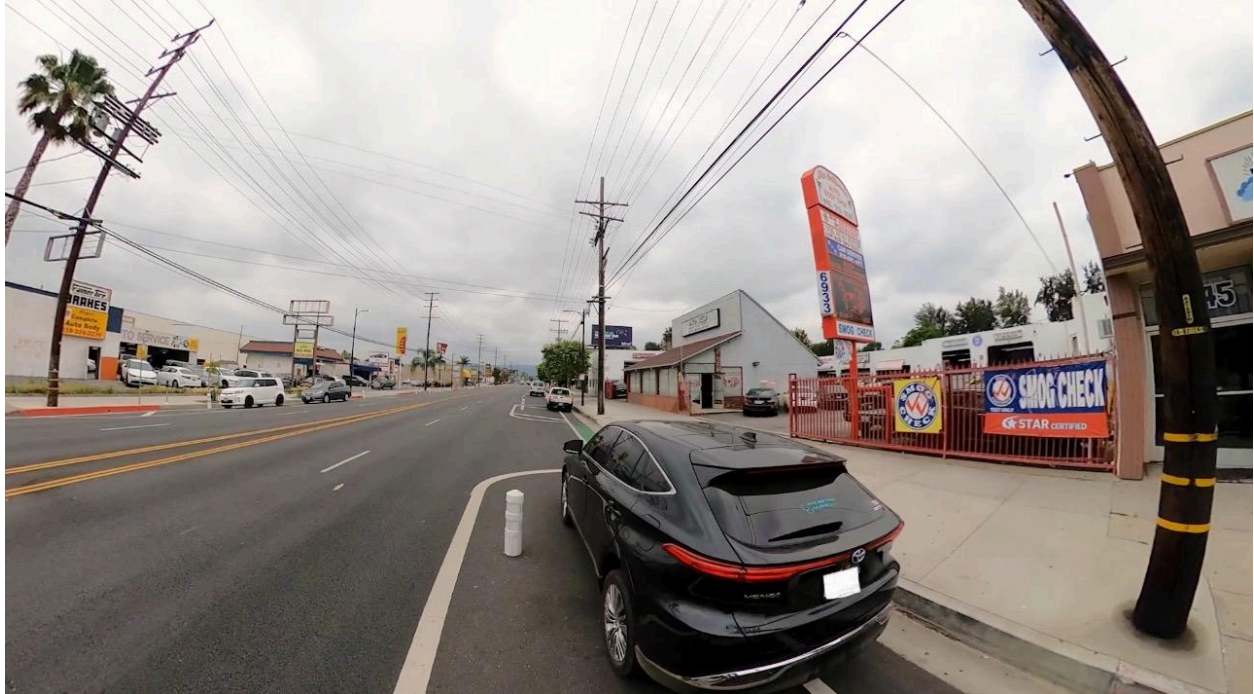
Two parked cars blocking Reseda Bl bike lane.