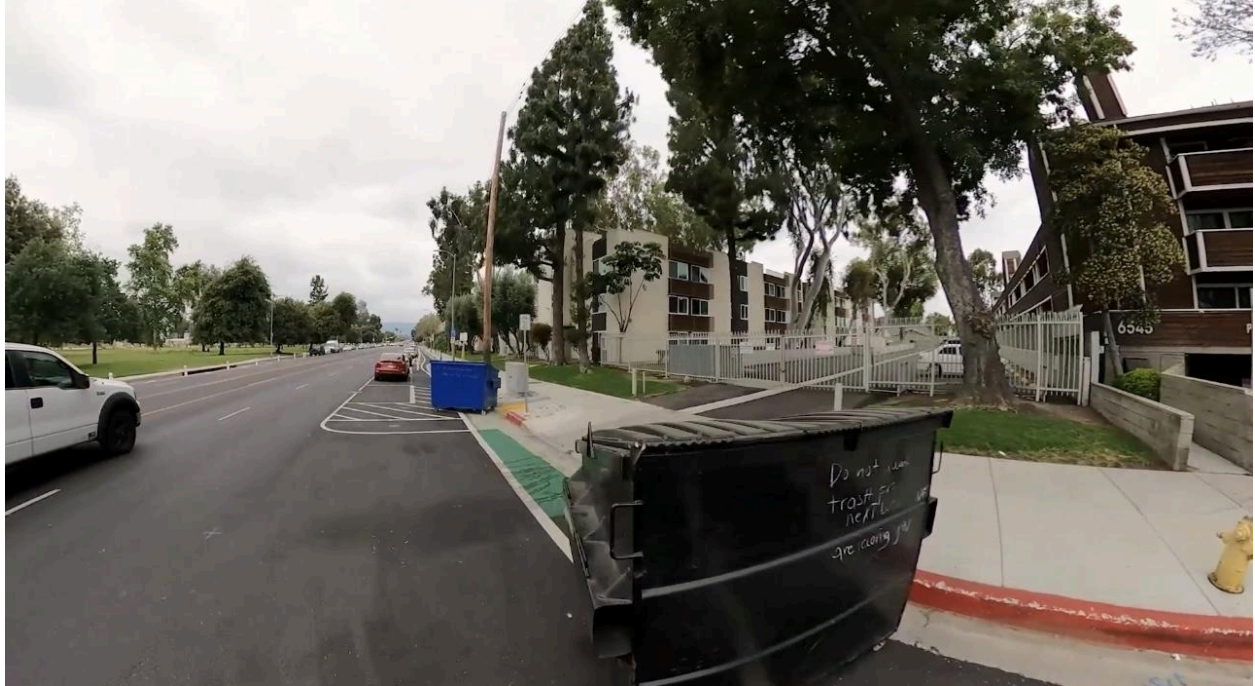
Dumpsters blocking bike lanes by Reseda Park.