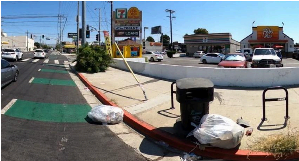
Trash bags left in bike/mixed-traffic turning lane.