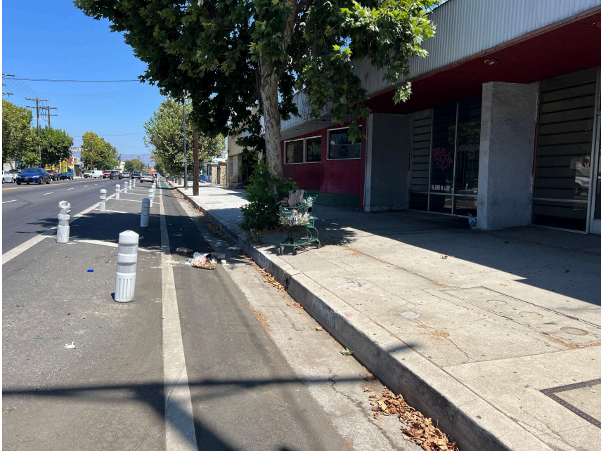
Litter overflowing from trash-filled shopping cart obstructing the bicycle lane.