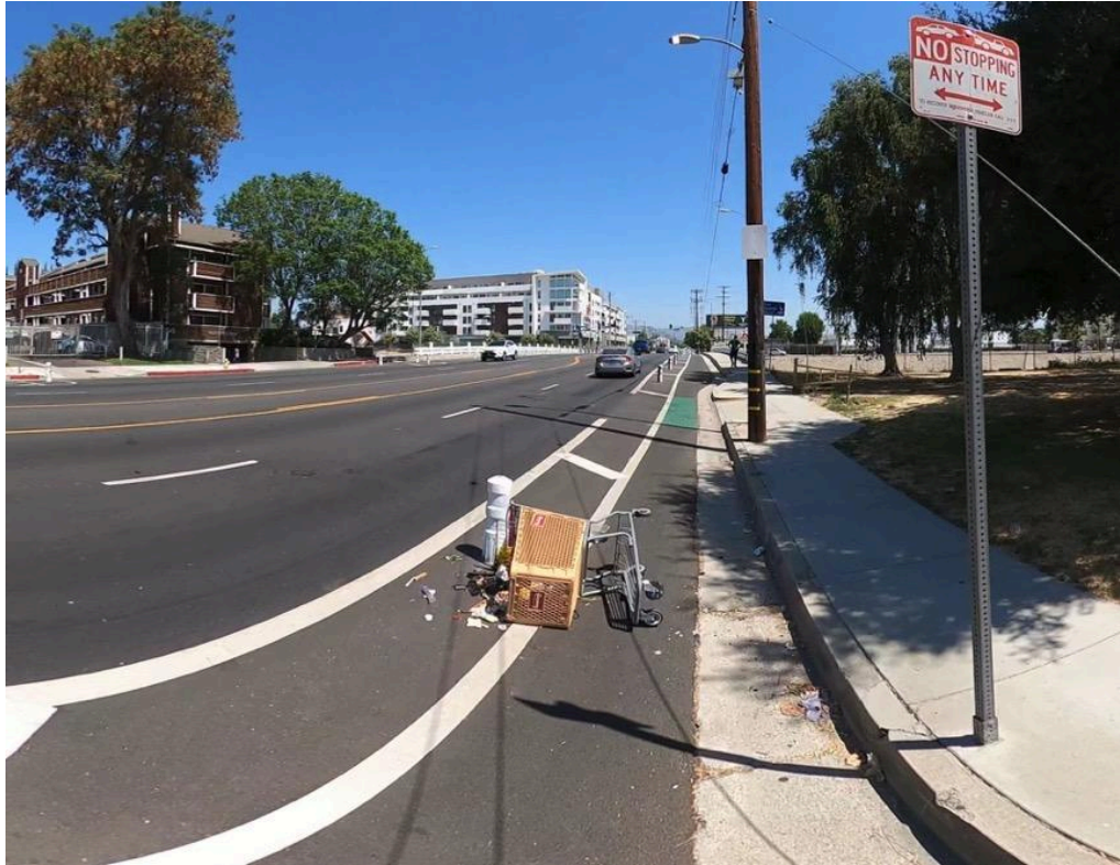
An overturned, trash-filled shopping cart in the bike lane next to Reseda Park.

This community impact statement was passed in a meeting held in accordance with the Brown Act on March 17, 2025 with a vote of 13 yes, 0 no, 1 abstain, 0 recused.