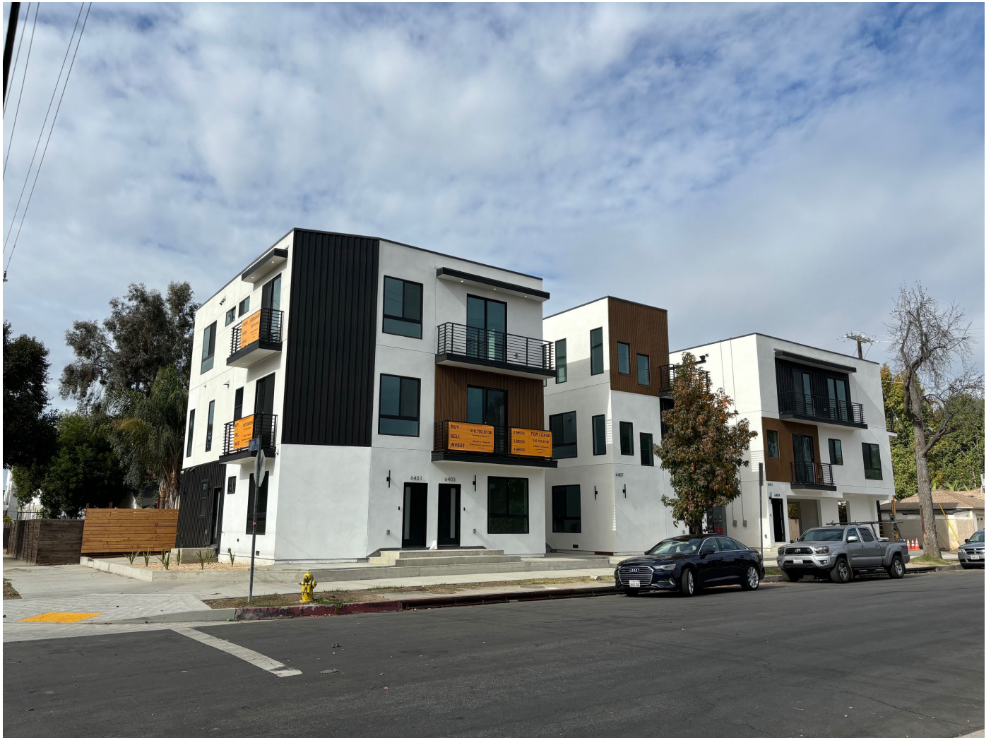
Two 3 story duplexes and a “recreation room” in the middle.....