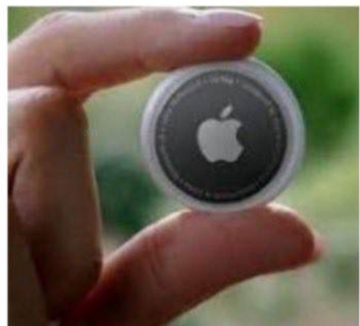
Apple Air Tags

Los Angeles police department says do not use Akuvox