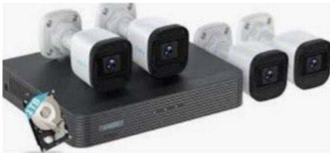
Wired security system