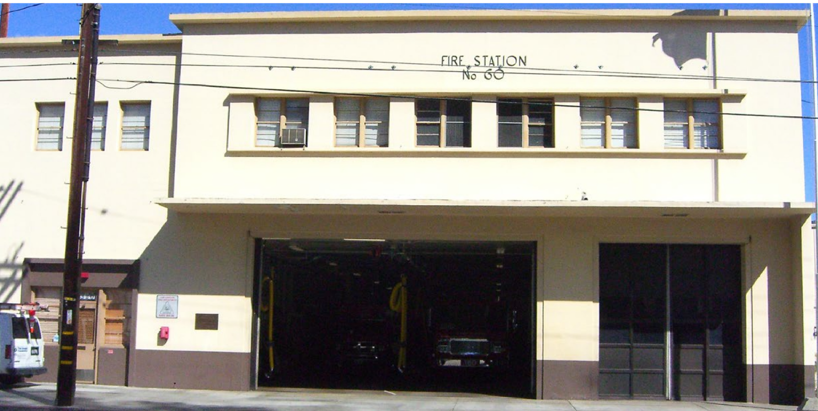
A fire station serving the North Hollywood community.

More information on wildfire, including a history of major events, a map of Very High Fire Hazard Severity Zones, and details on secondary impacts, can be found in the LHMP. Specific operational measures related to brush fires can be found in the Brush Fire annex of the Emergency Operations Plan.