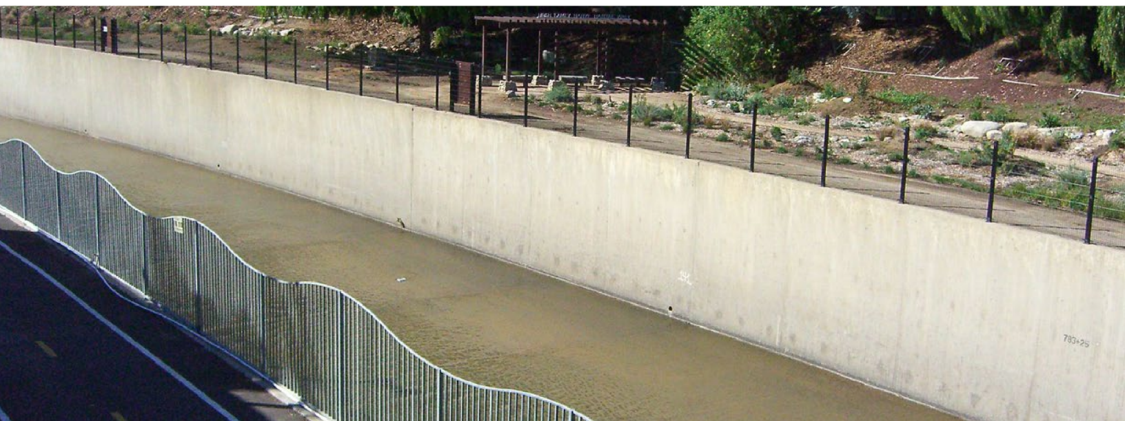
The Los Angeles River in Studio City, once a source of frequent flooding, now serves as a transportation and open space resource.

Capital Floods. Major storms which cause a high magnitude of water flow can be devastating to a wide geographic area. They are the most dramatic and potentially the most hazardous water activity confronting the City. The Los Angeles region is a semi-arid region with rainfall that can have dramatic variation from year to year. Rains tend to occur in heavy, short duration storms between November and April. Severe storms are periodic and may not occur for several years. Paving of the City with structures and impermeable surfaces has reduced natural ponding areas which allowed water to percolate into the soil. This has facilitated water run-off and velocity of runoff thereby