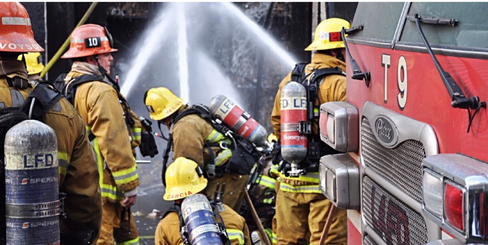
Los Angeles Fire Department responding to a structure fire.

The Los Angeles City Fire Department was established on February 1, 1886. Thirty firefighters, most of them former volunteers, were hired to man four leased firehouses. In addition, volunteer units were retained in the less populated areas outside the central city, including the San Fernando Valley. From the beginning the Department was an innovative, progressive agency which sought to secure the latest equipment, utilize the latest techniques and to develop better methods for fire fighting and prevention.