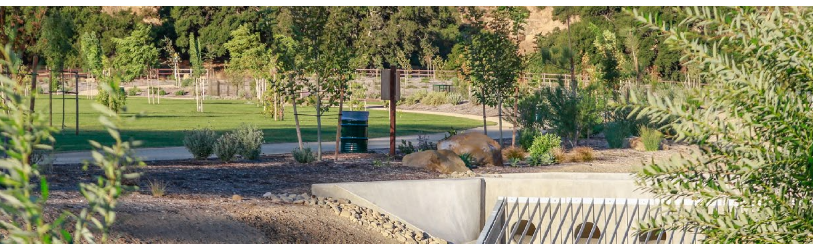
Stormwater infrastructure in Chatsworth Park South.

Generally short term goals are targeted for 0-5 years, medium term goals are 5-10 years, and long term goals are expected to take 15+ years to implement. A listing of department abbreviations is available in Appendix A.