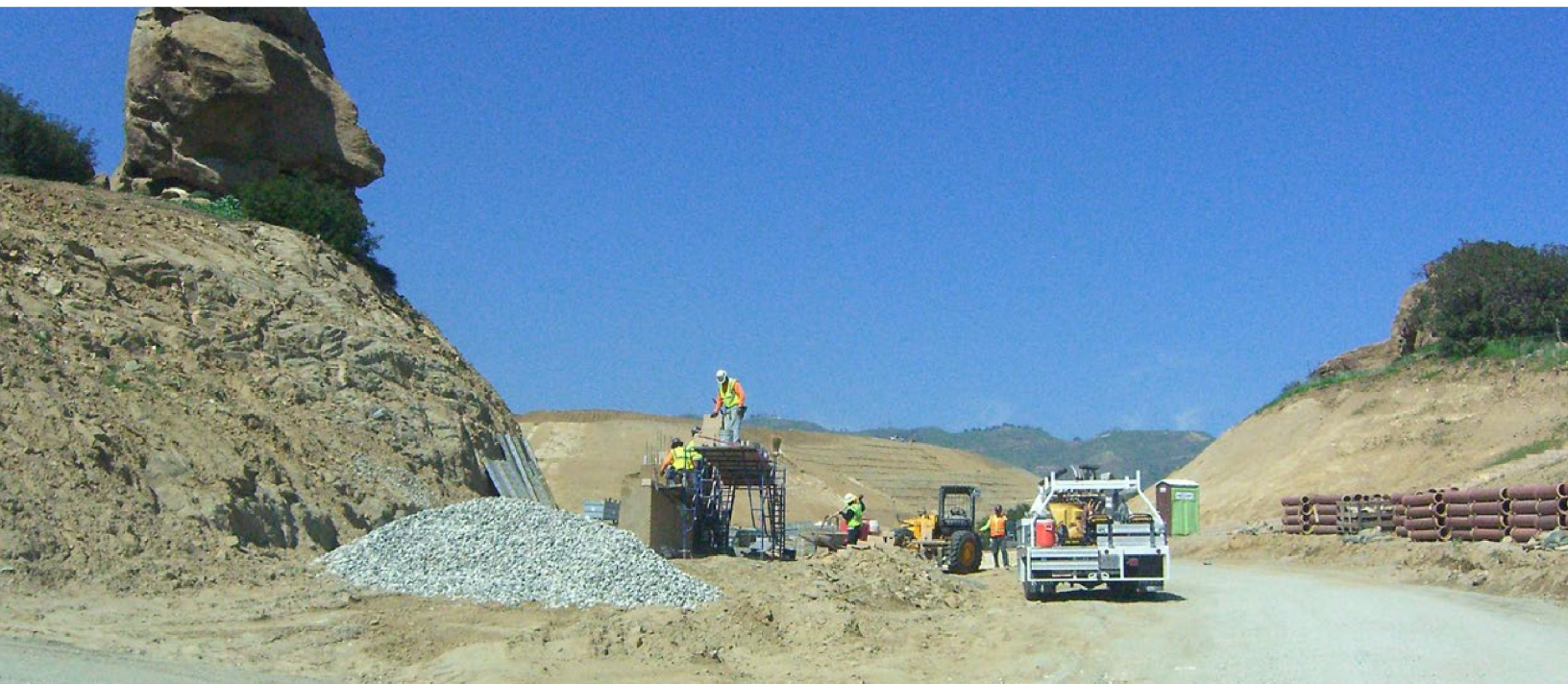
Hillside grading in the western San Fernando Valley.

The principal tools for mitigation of geologic hazards is the City's Municipal Code, including the Building and Zoning Codes. In 1929 the Building and Safety Department began to compile and correlate data on soil conditions for distribution to realtors,