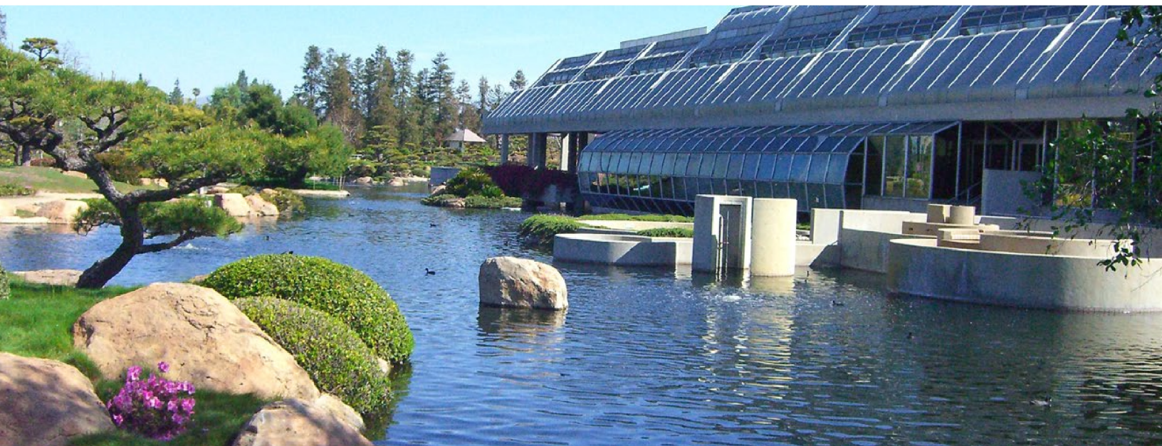
Donald C. Tillman Water Reclamation Plant and Japanese Gardens