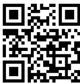
QR Code to Online Appeal Filing

An appeal application must be submitted and paid for before 4:30 PM (PST) on the final day to appeal the determination. Should the final day fall on a weekend or legal City holiday, the time for filing an appeal shall be extended to 4:30 PM (PST) on the next succeeding working day. Appeals should be filed early to ensure that DSC staff members have adequate time to review and accept the documents, and to allow appellants time to submit payment.