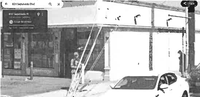
Goggle Maps Photo from January 2017 - Previous Dispensary - Note surrounded by Apartment Buildings /Homes