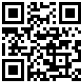
QR Code to Online Appeal Filing

Verification of condition compliance with building plans and/or building permit applications are done at the City Planning Metro or Valley DSC locations. An in-person or virtual appointment for Condition Clearance can be made through the City's BuildLA portal ( appointments.lacity.gov ). The applicant is further advised to notify any consultant representing you of this requirement as well.