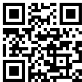
QR Code to Online Appeal Filing

Verification of condition compliance with building plans and/or building permit applications are done at the City Planning Metro or Valley DSC locations. An in-person or virtual appointment for Condition Clearance can be made through the City's BuildLA portal ( appointments.lacity.org ). The applicant is further advised to notify any consultant representing you of this requirement as well.