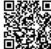
QR Code to BuildLA Appointment Portal for Condition Clearance

Attachments: Deputy Advisory Agency's Determination Dated May 15, 2025, Tract Map No. TT-84566-CC