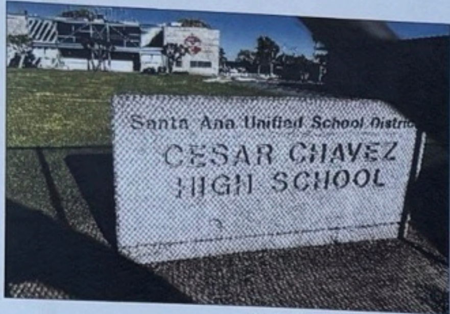
ALLEN SCHABEN Los Angeles Times