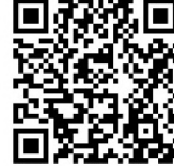
QR Code to BuildLA Appointment Portal for Condition Clearance

Attachments: Ordinance, Maps, Conditions of Approval, Findings, Resolution