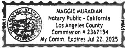
Place Notary Stamp Above

Signature [Handwritten Signature] Signature of Notary Public