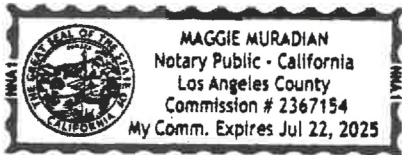
Place Notary Stamp Above

Signature [Handwritten Signature] Signature of Notary Public