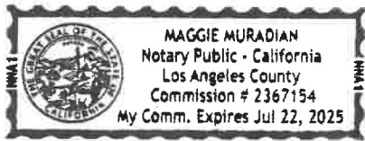
Place Notary Stamp Above

Signature [Handwritten Signature] Signature of Notary Public