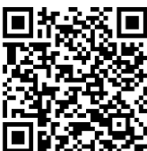
QR Code to Forms for In-Person Appeal Filing

Drop off at DSC. Appeals of this determination can be submitted in-person at the Metro or Van Nuys DSC locations, as well as the South Los Angeles DSC on Tuesdays and Thursdays only, and payment can be made by credit card or check.