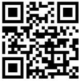
QR Code to Online Appeal Filing

Online Application System (OAS): The OAS ( https://planning.lacity.gov/oas ) allows entitlement appeals to be submitted entirely online. Appeal fees may be paid for by credit card or e-check.