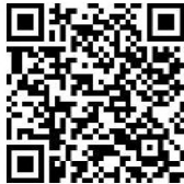
QR Code to Forms for In-Person Appeal Filing

Drop off at DSC. Appeals of this determination can be submitted in-person at the Metro or Van Nuys DSC locations, as well as the South Los Angeles DSC on Tuesdays and Thursdays only, and payment can be made by credit card or check.