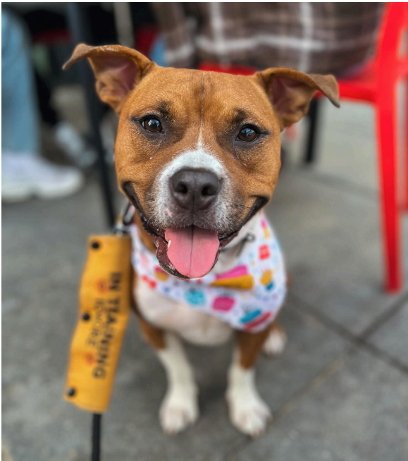
Teddy (rescued in September 2024 from Downey)