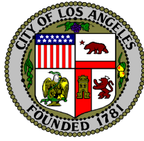
KAREN BASS MAYOR