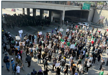
CITYWIDE DEMONSTRATIONS JUNE