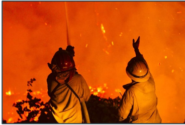
PALISADES FIRE JANUARY - OCTOBER