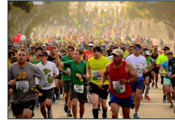
LA MARATHON MARCH