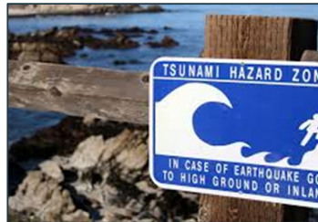
TSUNAMI ADVISORY JULY