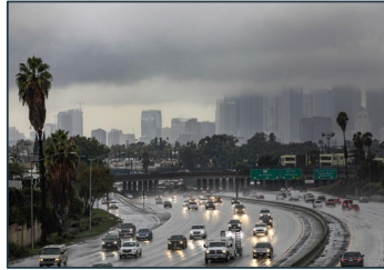
RAINSTORMS FEB., MAR., OCT., NOV., &