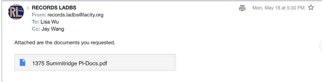
Exhibit A – Screenshot reflecting the timing of receipt of project materials and technical records on May 18, 2026.